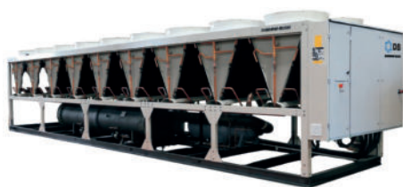
ACHX-EVE 93~514TR (326~1806KW)

The chiller package is designed to ensure optimal lubrication, extending compressor life and maintaining system efficiency. It includes an advanced pressure differential lubrication system, featuring an oil filter, sight glass, oil sump, and oil sump heater. The oil heater activates when the chiller is off, preventing oil dilution and further enhancing reliability and performance.